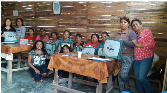
Women working with the Hope Project

GIAHC worked with their team to produce awareness videos in their local languages, including Spanish, English, Quechua, and Aymara. The videos can be played here .