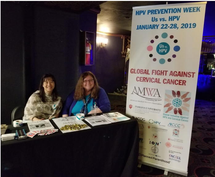
At the RAW Science Film Festival