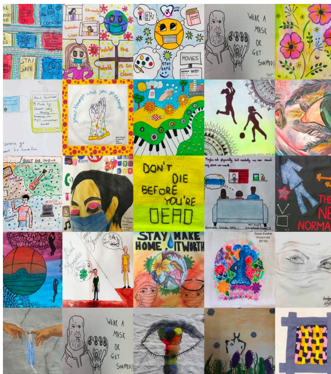
Image of quilt squares from the Corona Quilt Project on Instagram @coronaquiltproject